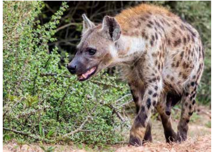
Spotted hyenas Crocota crocuta .

Spotted hyenas are efficient hunters, able to kill animals several times their size, with a success rate of 25-35% (Kruuk, 1972a; Mills, 1990). In ecosystems with high prey densities, such as the Maasai Mara in