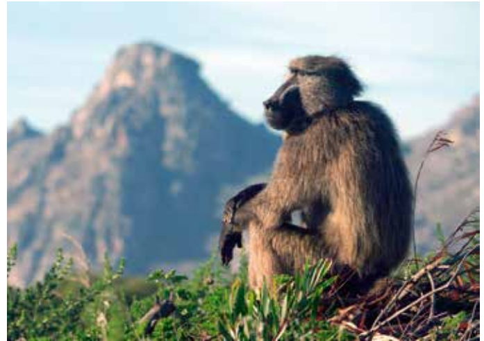
Chacma baboon Papio ursinus .

Baboons are large, widely distributed primates that are capable of living in a variety of habitats, even those heavily encroached or transformed by human activities (Altmann & Altmann, 1970; Swedell, 2011). The adaptability of baboons is mostly a function of their generalist diet, dexterity and scope of social learning (Swedell, 2011). While baboons' diet is composed predominantly of plant matter (Altmann & Altmann, 1970; Swedell, 2011), predatory behaviour has been described in most baboon species and is best known in olive baboons Papio anubis in central and western Africa (Dart, 1963; Strum, 1975; Hausfater, 1976; Hamilton & Busse, 1978; Strum, 1981; Davies & Cowlshaw, 1996). Potential wild prey species include various small ungulates, such as Thomson's gazelles Gazella thomsoni ,