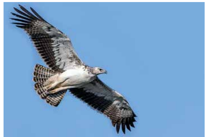
Martial eagle Polemaetus bellicosus.