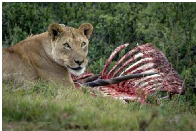
Lion Panthera leo .

In addition to ecological factors, social dynamics also influences lion home range metrics to varying degrees (Heinsohn & Packer, 1995). The home ranges of large prides in optimal patches may be smaller than expected, and the converse may be true for smaller prides in less productive areas. Thus, the number of adult females within a pride seems to influence the quality of the territory and may influence its relative size. Finally, anthropogenic influences could influence the movements and thus